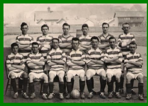
Belfast Celtic 1923-24

During their time in competition, Celtic had won the Irish League fourteen times, the Irish Cup eight times, the City Cup Winners ten times and the Gold Cup seven times. The Belfast Celtic team was the pride of Irish football until it was forced out of competition after the dramatic game against Belfast rivals Linfield on Boxing Day 1948.