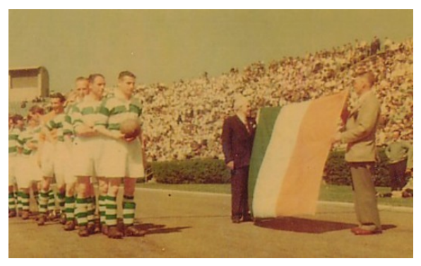
The Final Tour 1949

have established a permanent collection of Belfast Celtic memorabilia in The Belfast Celtic Museum in the Park Centre in Belfast. We actively use the internet and social media to raise awareness of the history and traditions of the Grand Old Team.